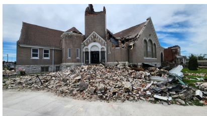
Centennial Christian Church (DOC), St. Louis