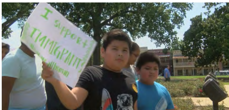
Kids directly impacted by the raids held a youth-led prayer today on the Canton Square.

By Summer Tadlock | August 11, 2019 at 10:42 PM CDT - Updated August 12 at 8:38 AM