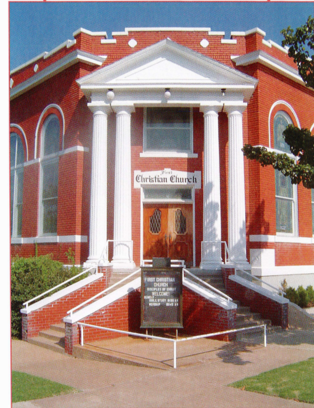
The Christian Church Commission of The Christian Church (Disciples of Christ) in Oklahoma