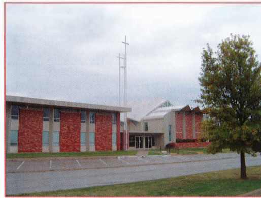
Village Christian Church, Oklahoma City