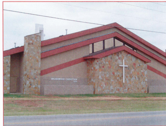
Wildewood Christian Church, Oklahoma City