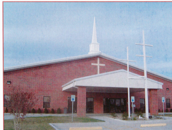
First Christian Church, Moore