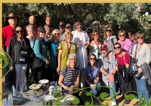
Interfaith Group Trip to Holy Land Panel Discussion